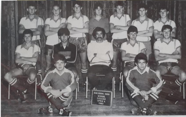
SOCCER OPEN A